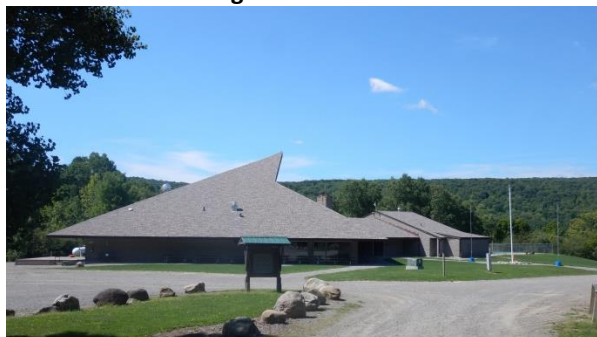
Dining Hall & Swim Center