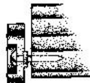
↑ Acceptable Wheels ↑